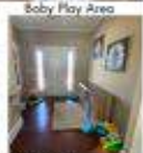
Baby Play Area