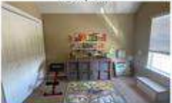
Play and Learn Area