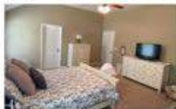
Kimberlee & Jon's Bedroom