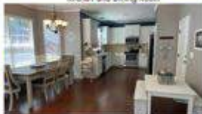
Kitchen and Dining Room