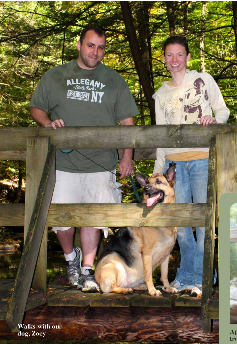
Walks with our dog, Zoey