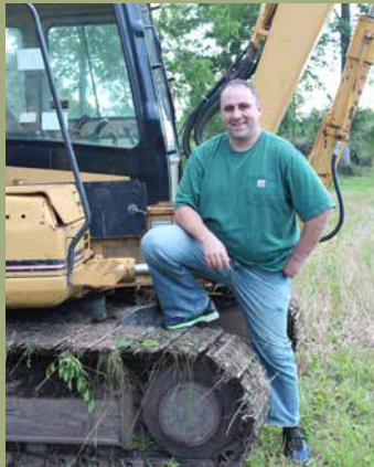
There is always wood to be split