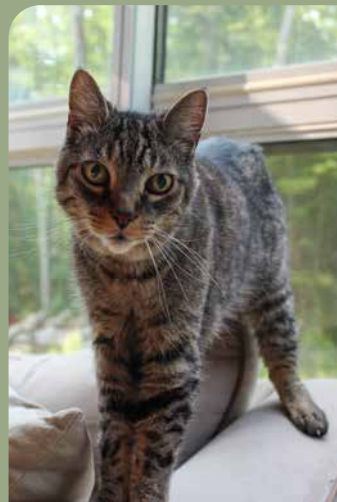
Apollo searching for trouble or begging for food

Loves pets and bathing, hates being picked up. Very talkative and will circle you when she wants attention (re: Sharky).