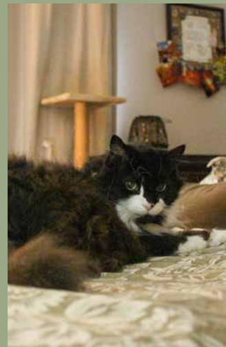
Bootsy lounging, per usual