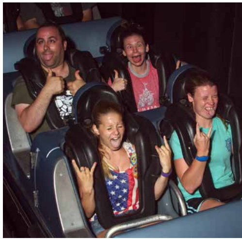
Making a weird face for the camera is a family tradition on AJ's side!