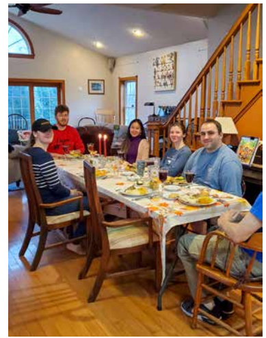
AJ's mom's Thanksgiving spread