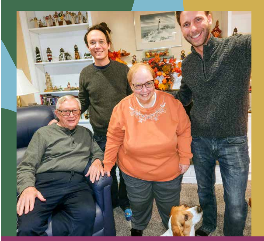
OUR HOME WHERE WE ALL LIVE AND WANT TO START THE NEXT CHAPTER