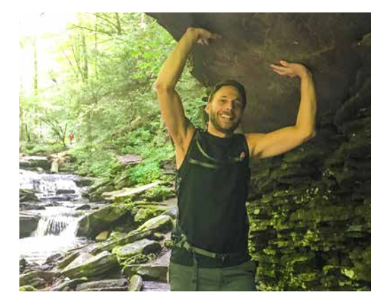
ADVENTURES IS ONE OF THE MOST EXCITING THINGS IN LIFE