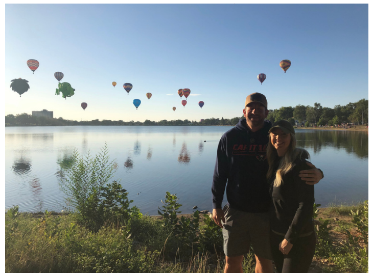
Hot Air Balloon Festival, 2018

We live around some of the best schools in the city that are all within close proximity to our home. Our neighborhood is home to many young families with children that will make for perfect playmates!