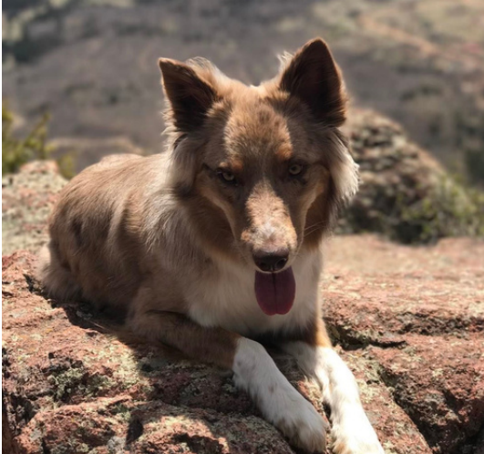
PENNY, AGE 8

Penny is a very playful Australian Shepard/Poodle mix. She's very patient with children and is always looking for a new play companion. Tim adopted Penny when she was just a puppy and they are still best of friends!