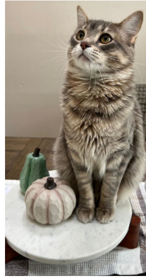
STEWIE. 8 MONTHS

Stewie is the newest member of our family. He is the perfect fit for our lives as he loves to play as well as snuggle up with us. He is very sociable and keeps us laughing with his playful antics.