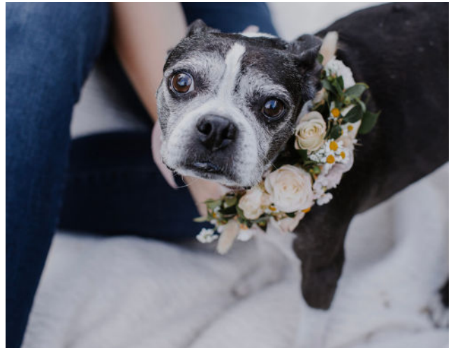
DAISY, AGE 13

Penny is a very playful Australian Shepard/Poodle mix. She's very patient with children and is always looking for a new play companion. Tim adopted Penny when she was just a puppy and they are still best of friends!