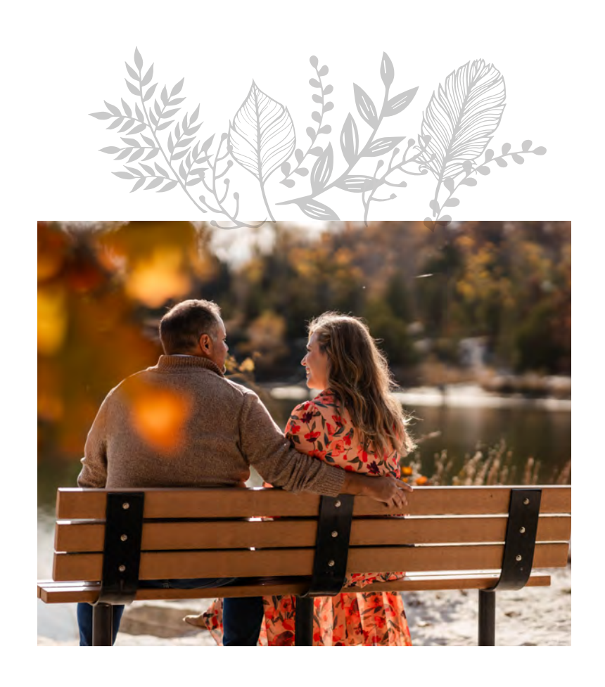
WE'RE SO EXCITED TO MEET YOU!