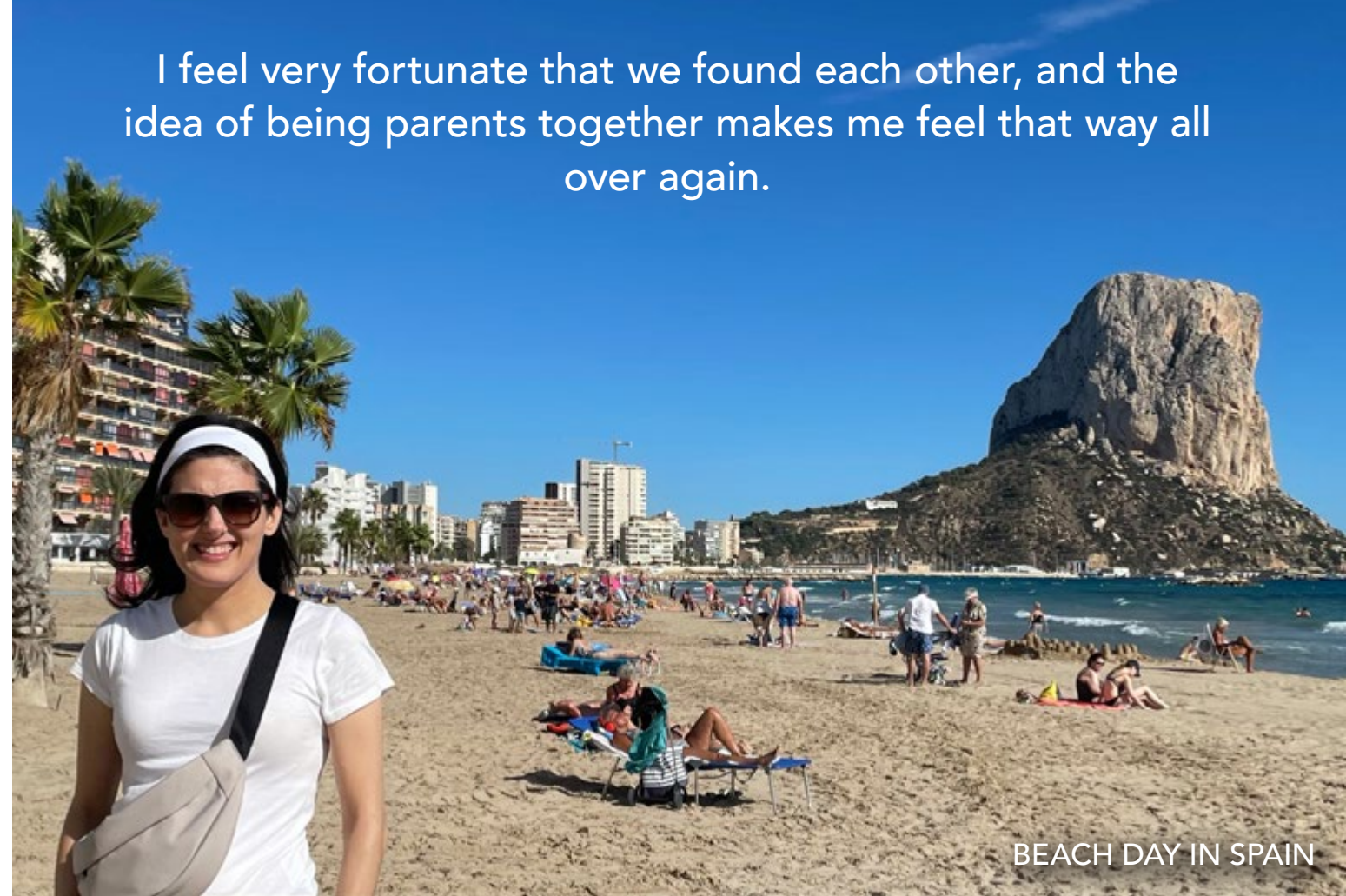
BEACH DAY IN SPAIN