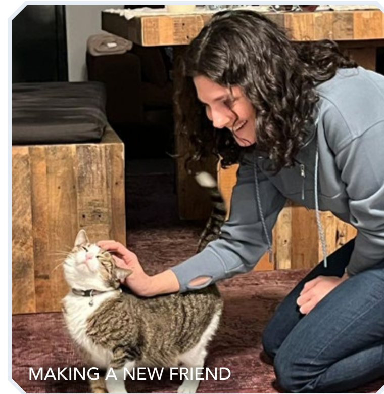
MAKING A NEW FRIEND