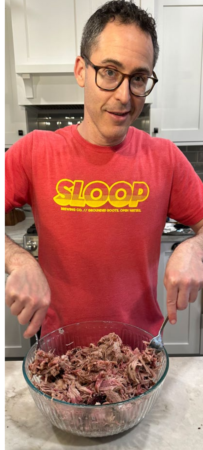
PULLED PORK SUCCESS

EXTRA BEDROOM & PLANT NURSERY... TO BECOME BABY NURSERY