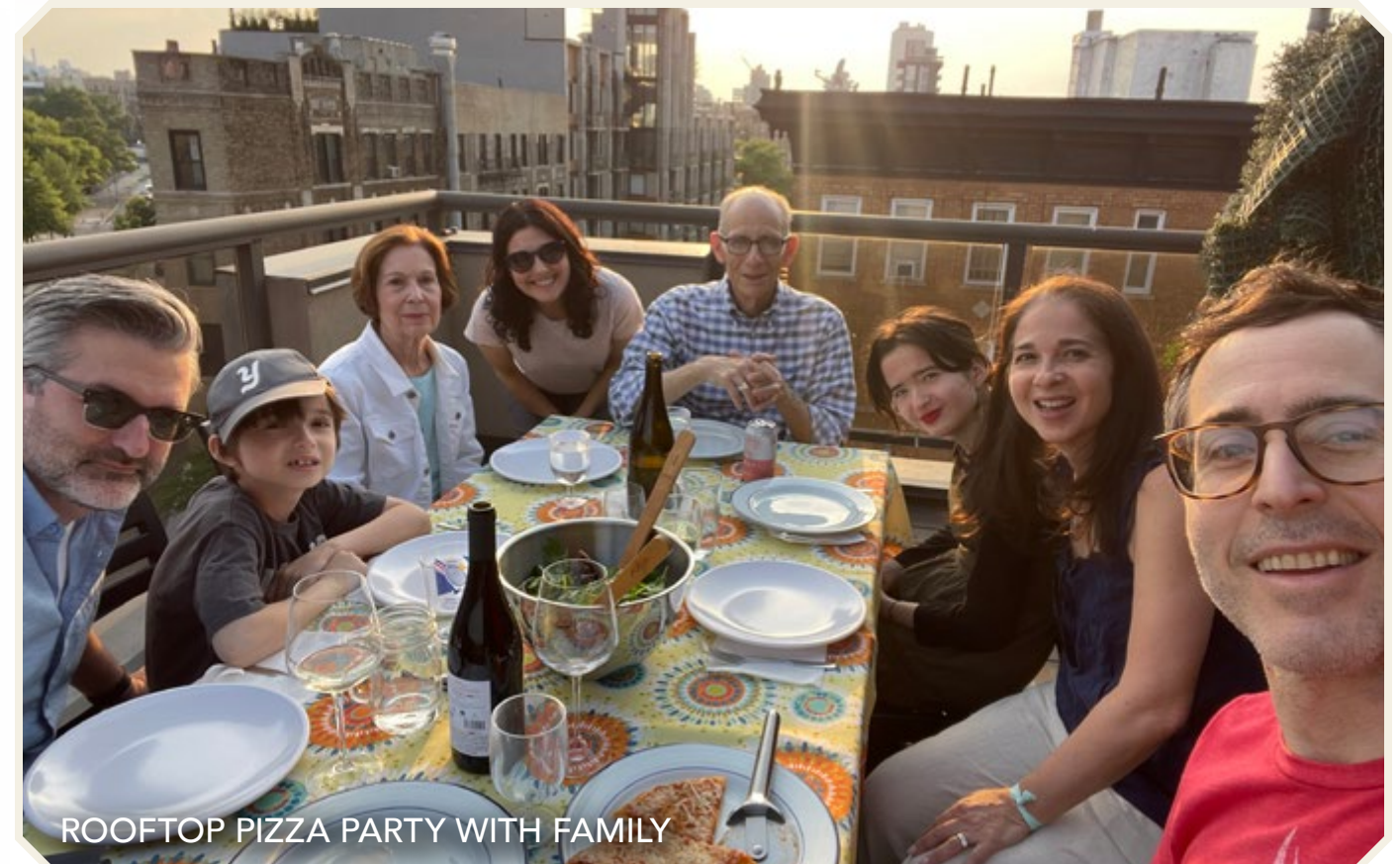
ROOFTOP PIZZA PARTY WITH FAMILY

Outside includes two beautiful rooftop patios that are private to our area; a courtyard, which we make good use of for relaxing, working, and entertaining; there are half a dozen parks in walking distance, small and large, offering everything from playgrounds with water features to sports fields to picnic lawns with incredible skyline views.