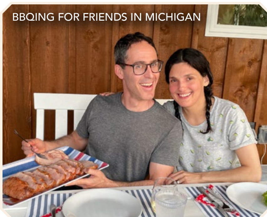
BBQING FOR FRIENDS IN MICHIGAN

We have so many great memories traveling and cooking together and can't wait to share these experiences with a little one!