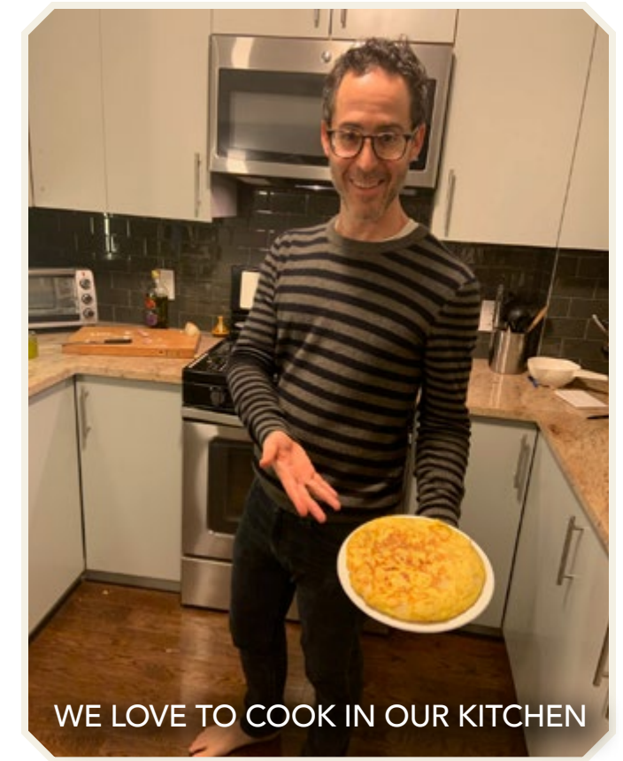
WE LOVE TO COOK IN OUR KITCHEN

Finally, New York City will be such a fun place to grow up. The city is our playground, and we can't wait to bring a child along.