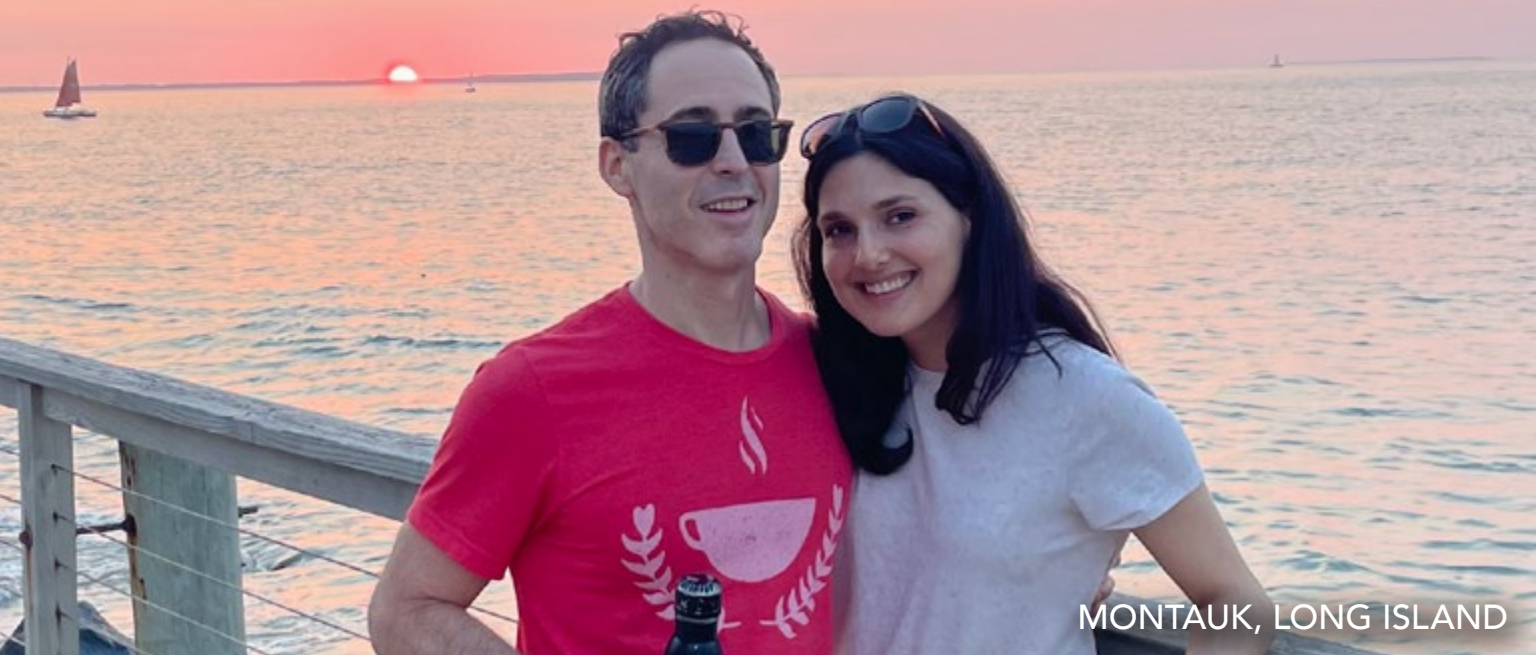
MONTAUK, LONG ISLAND