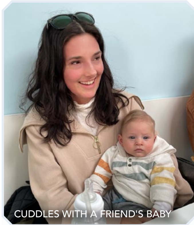
CUDDLES WITH A FRIEND'S BABY

She gives so much to her relationships with friends and family. As a result, we have a large network of friends and family who are eager to support us in raising a child.