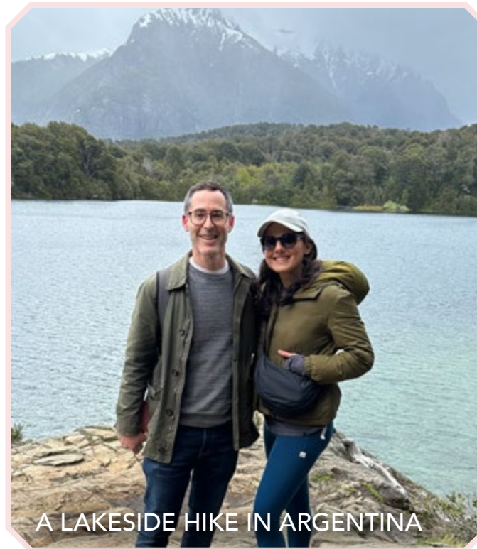
A LAKESIDE HIKE IN ARGENTINA