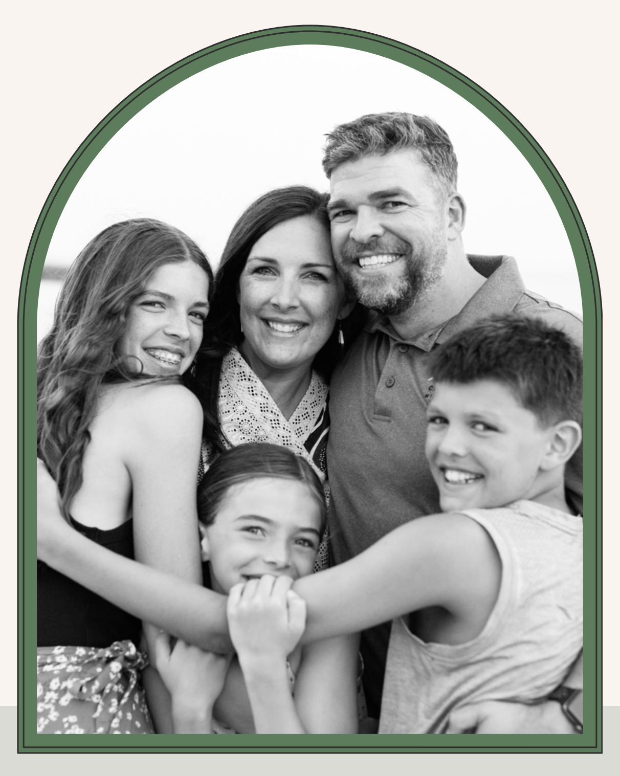
We can't wait to meet you!