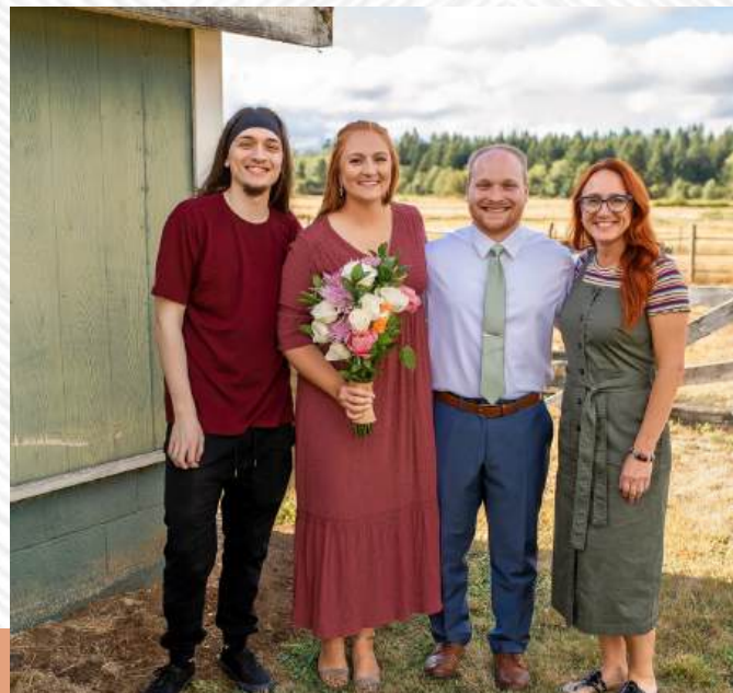
GRETCHEN'S MOM AND YOUNGER BROTHER