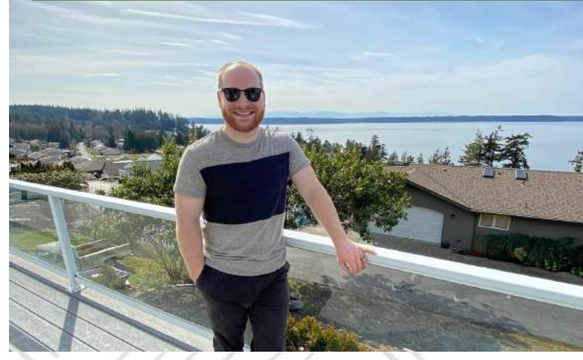
CAMANO ISLAND OVERLOOKING THE CASCADE MOUNTAIN RANGE