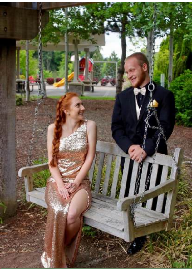
OUR FIRST DATE: PROM

AS HIGH SCHOOL SWEETHEARTS, WE HAVE HAD THE PRIVILEGE OF GROWING ALONGSIDE EACH OTHER THROUGH MANY SEASONS OF LIFE. WE BOTH HIGHLY VALUE HONESTY, SERVICE, COMMUNICATION, AND QUALITY TIME. WE BOND OVER OUR SHARED FAITH AS FOLLOWERS OF CHRIST AND THE HOPE WE HAVE IN JESUS. WE BELIEVE FAMILY AND LOVING OTHERS WELL ARE ESSENTIAL, AND WE ARE EXCITED TO RAISE A FAMILY WITH THE SAME VALUES.