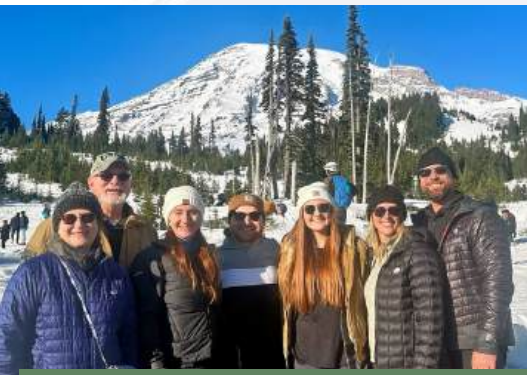
MT. RAINIER NATIONAL PARK