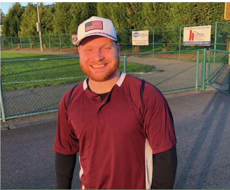
CHURCH SOFTBALL GAME