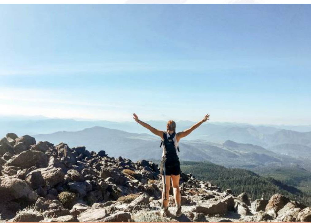
MT. ST. HELENS NATIONAL PARK