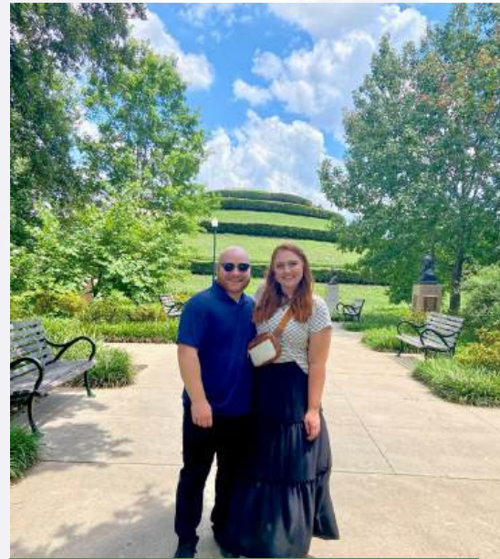
CENTENNIAL GARDENS IN TEXAS