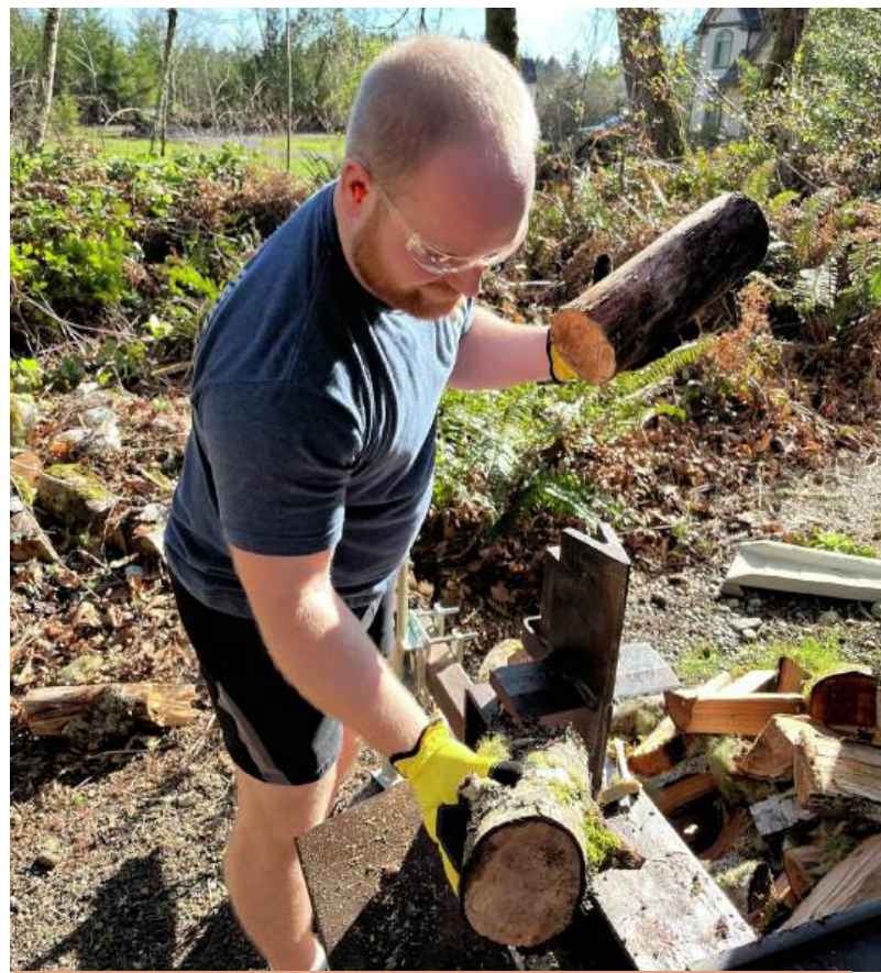
ALWAYS OUTSIDE IN NATURE

I HAVE PLAYED ON MULTIPLE SOFTBALL LEAGUES FOR THE LAST 10 YEARS