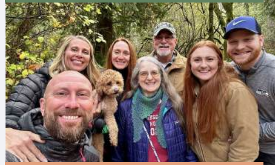
HIKING IN A STATE PARK